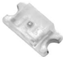
Absolute Maximum Ratings(Ta=25°C)